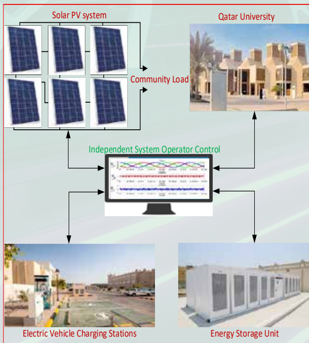
Figure 1: Conceptual diagram of EV charging integrated with solar PV systems and energy storage units' control via an independent system operator.

For a nation balancing its role as a global energy exporter with domestic decarbonization needs, the integration of renewable energy, advanced storage, and intelligent grids is crucial. Against this backdrop, EVs offer an opportunity to decarbonize transport, but their integration into Qatar's power system requires smart, adaptive strategies.